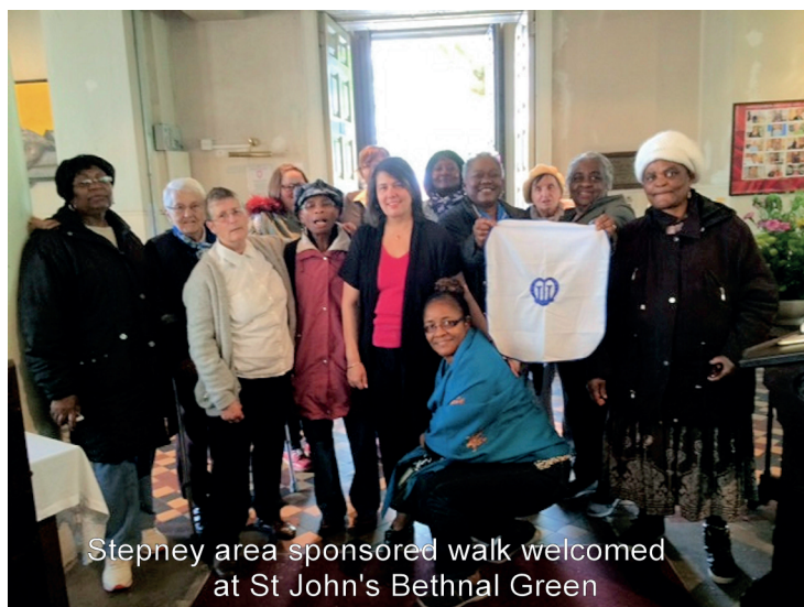
Stepney area sponsored walk welcomed at St John's Bethnal Green

We rode the bus to St. Paul's Bow Common where we were welcomed by the Rev.